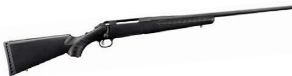
Table sponsor includes eight banquet tickets, eight door prize tickets, eight memberships and one rifle.

Purchase $150 of Shadow Bucks for only $100 . Good for most raffles: Rifle, Ladies, Sturgeon, Tool, Raffle/Raffle, Dinner & Mixed raffles. Registration must be received by 08/13/2018